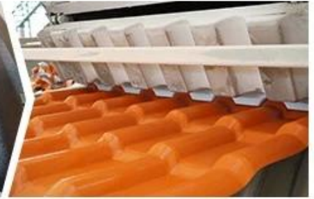
③ Compression Molding