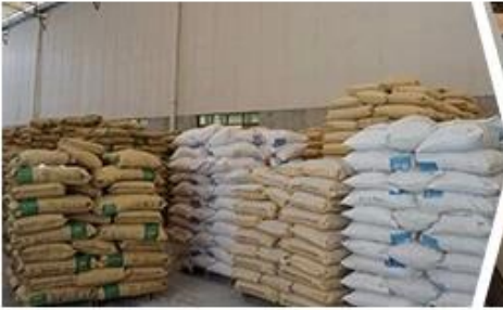
① Raw Materials