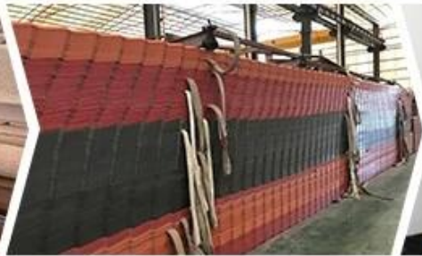
⑤ Finished Product