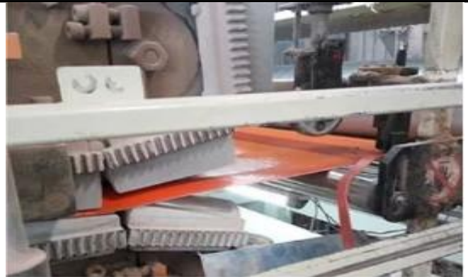
2. The mixed raw materials are pre-formed and heated to become flat tiles