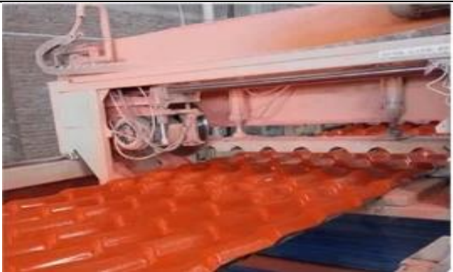
3. Then through the mold pressure, elastic the molding, cooling, through the traction machine slowly introduced