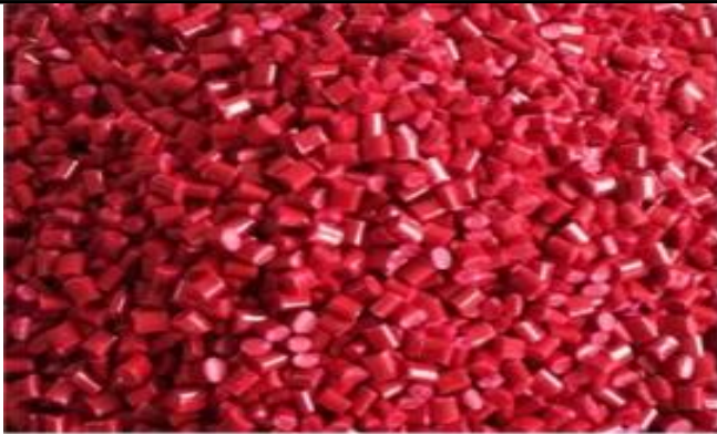
1. A variety of raw materials by a certain percentage mixing, into the hopper