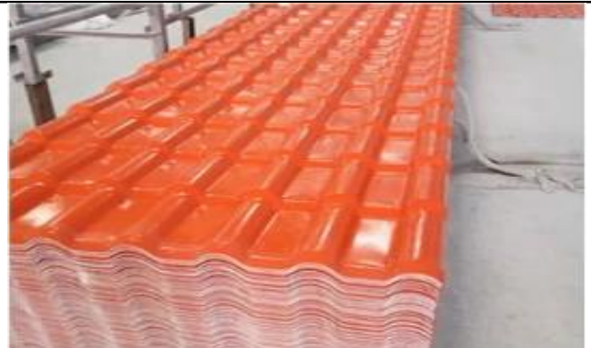
4. To achieve the length of customer needs cut off. after artificial out