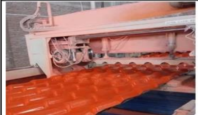
3. 生產過程中的 latic 材料，確保品質穩定。