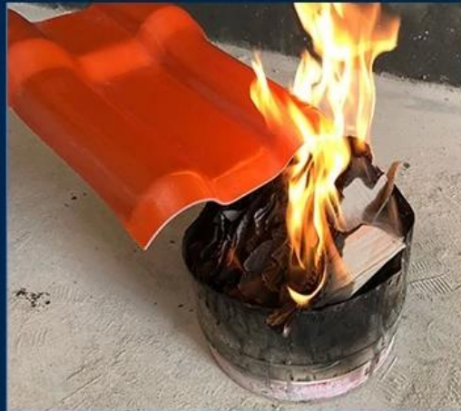
Fire Proof Grade B1