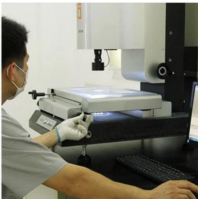
ASA Surface Thickness Test