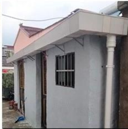
The villa receives water