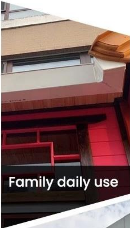
Family daily use