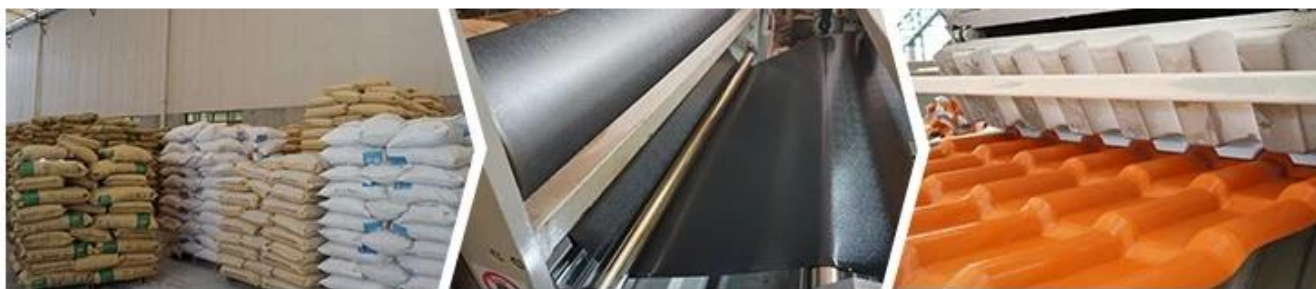
① Raw Materials