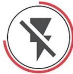
Not Conduct Electricity