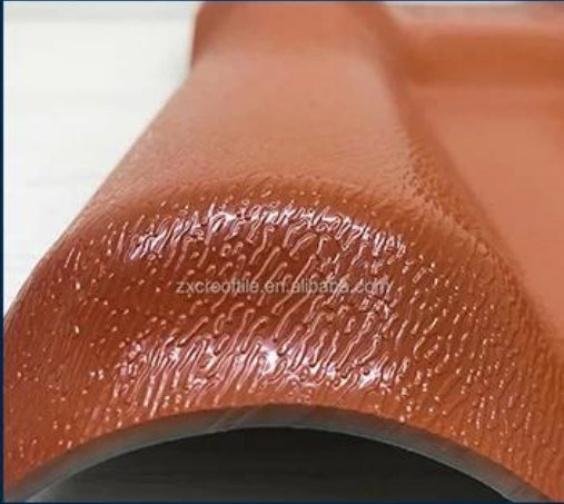
Surface asa material Lasting Color