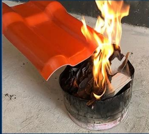
Fire Proof Grade B1