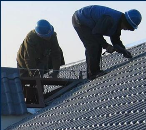
Easy and Quick Installation