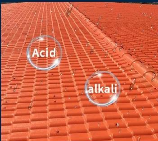
Anti-corrosion, Acid and Alkali Resistance