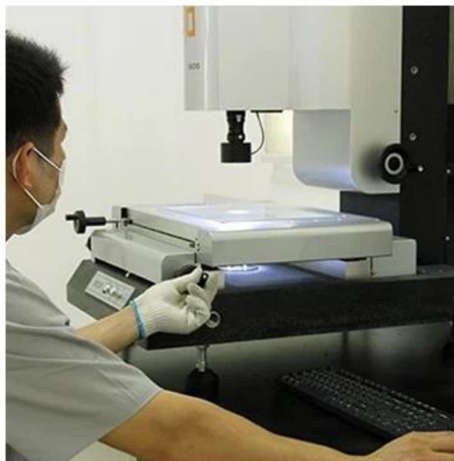
ASA SURFACE THICKNESS TEST