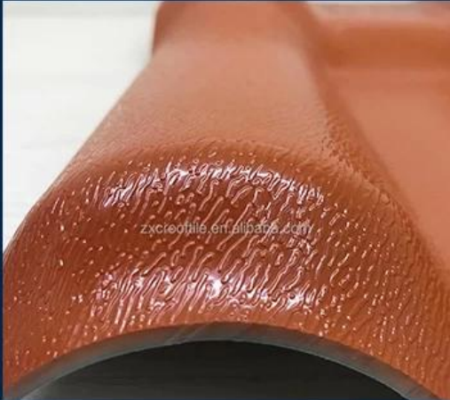
Surface asa material Lasting Color