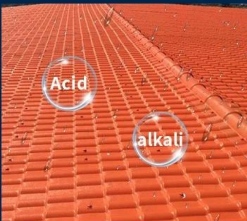
Anti-corrosion, Acid and Alkali Resistance