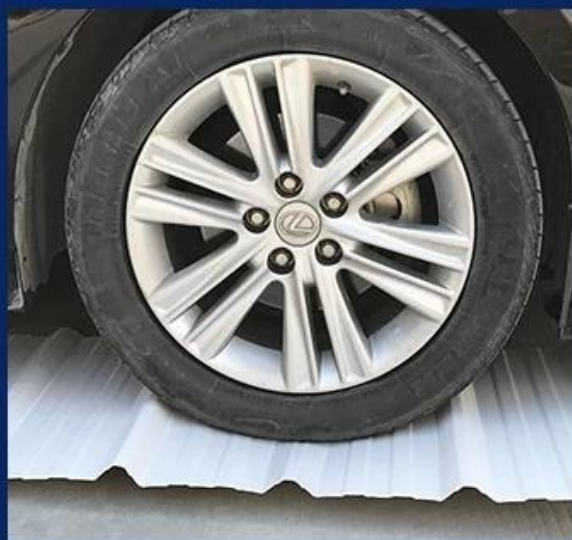
Strong pressure resistance