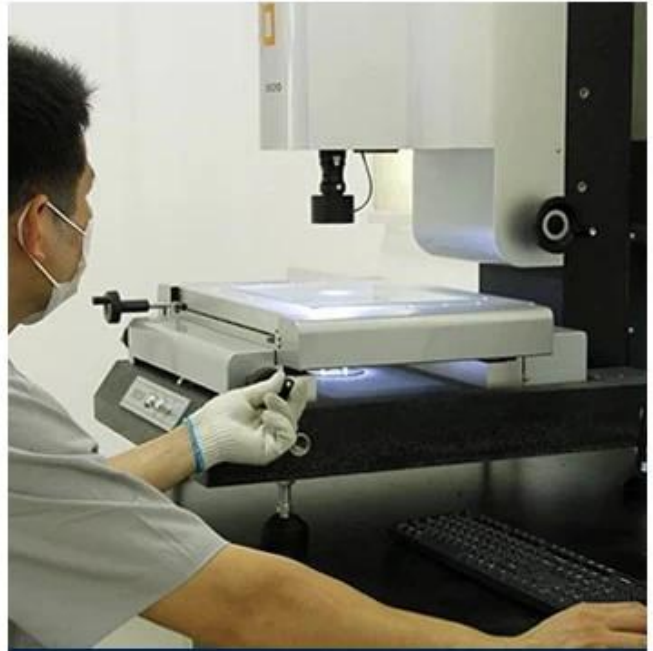
ASA SURFACE THICKNESS TEST