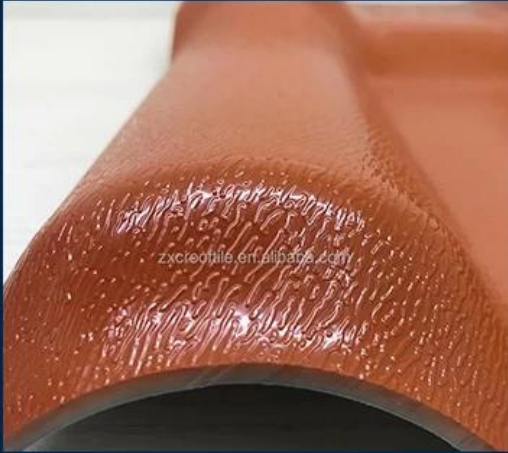
Surface asa material Lasting Color