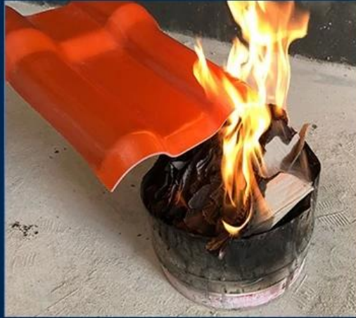
Fire Proof Grade B1