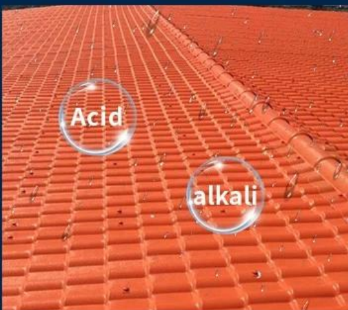
Anti-corrosion, Acid and Alkali Resistance