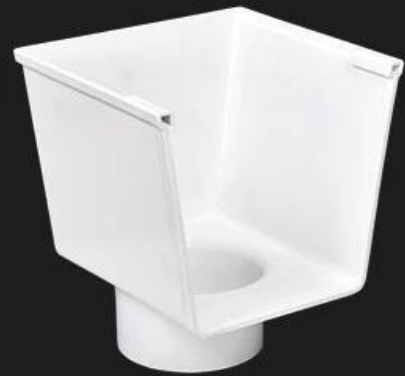
Drain end cap