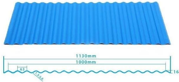
1130 trapezoidal sheets