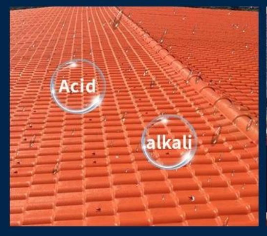
Anti-corrosion, Acid and Alkali Resistance