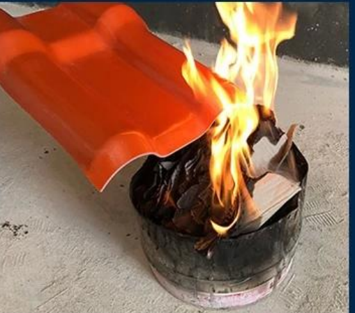
Fire Proof Grade B1