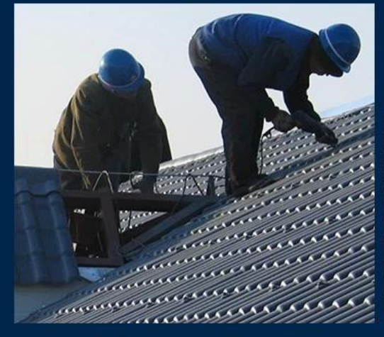
Easy and Quick Installation