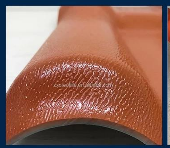
Surface asa material Lasting Color