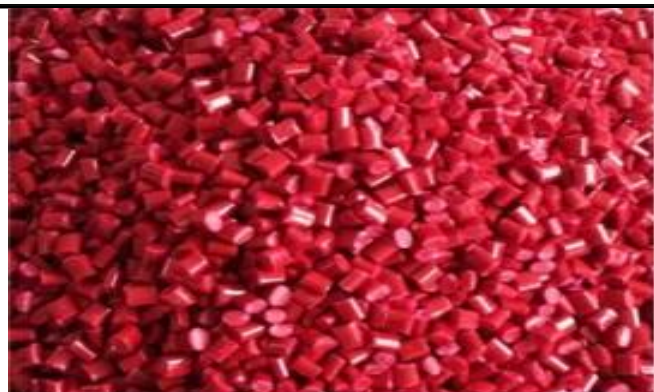
1. A variety of raw materials by a certain percentage mixing, into the hopper