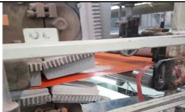
2. The mixed raw materials are pre-formed and heated to become flat tiles