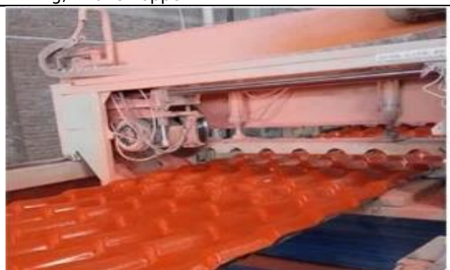
3. Then through the mold pressure, elastic the molding, cooling, through the traction machine slowly introduced