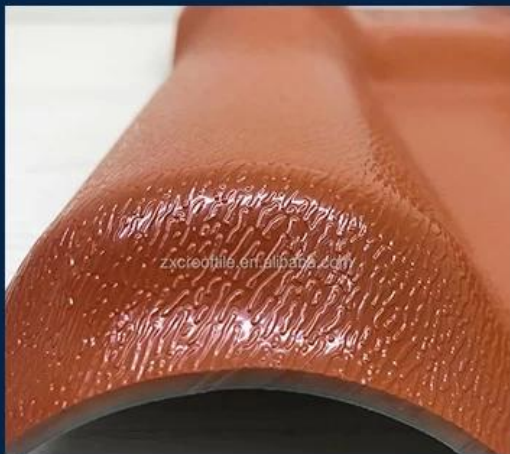
Surface asa material Lasting Color