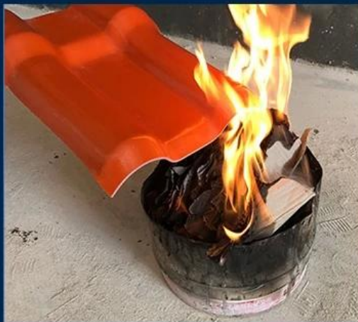
Fire Proof Grade B1