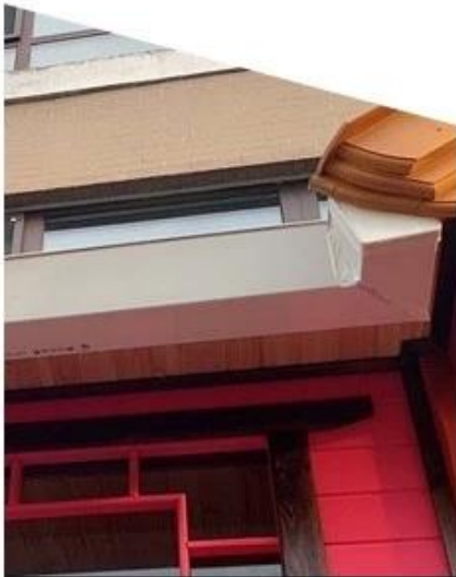
Family daily use