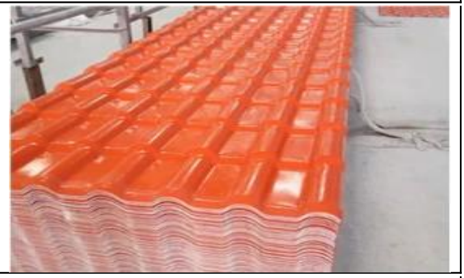
4.To achieve the length of customerneeds cut off. after artificial out

Click asa pvc roofing manufacturer china to learn more