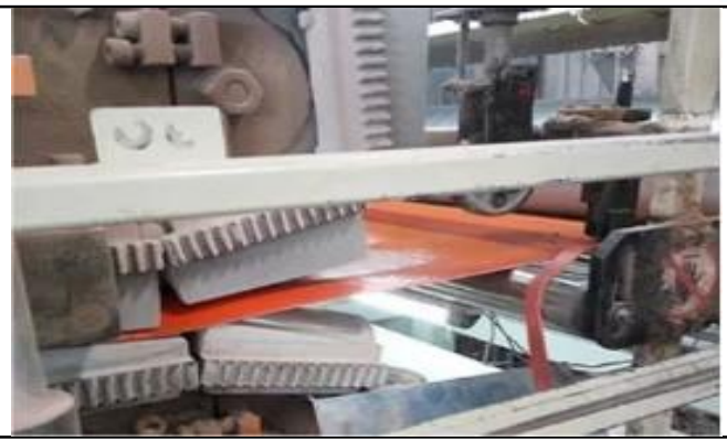
2. The mixed raw materials are pref -ormed and heated to become flat tiles