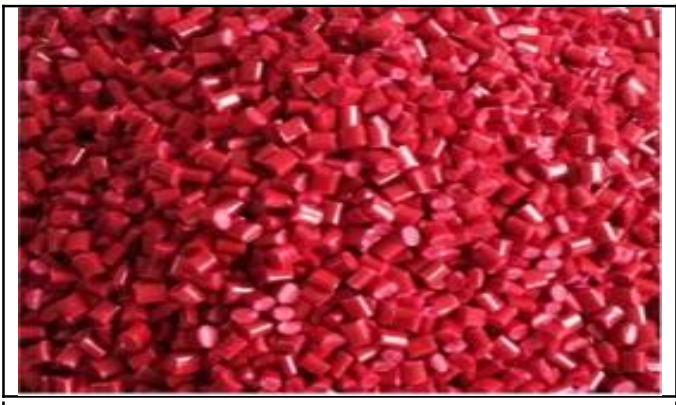
1.A variety of raw materials by a certain percentage mixing, intohe hopper