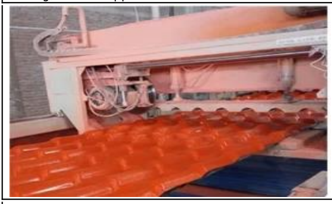
3. Then through the mold pressure, lastic the molding, cooling, throughthe traction machine slowly introduced