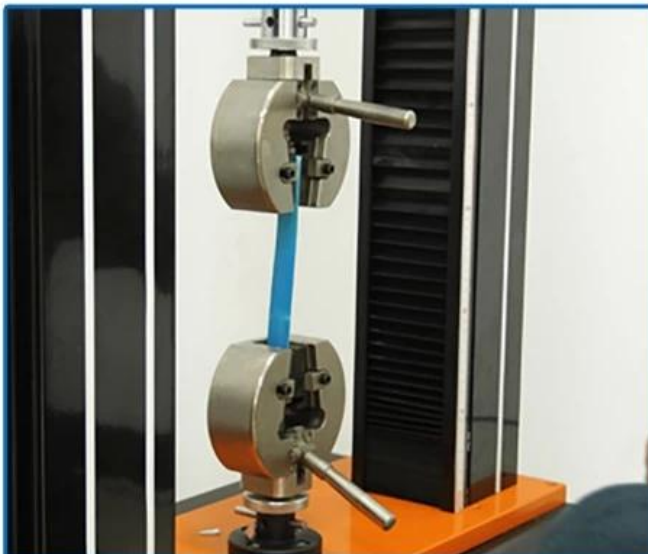
Tensile force testing