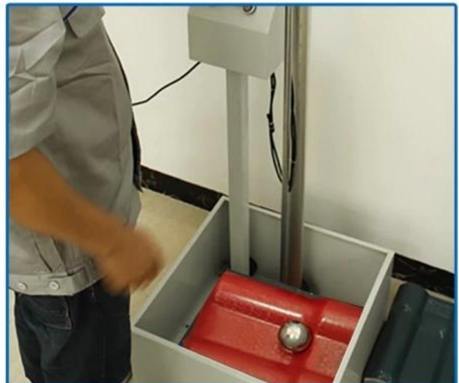
Impact resistance testing