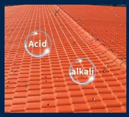
Anti-corrosion, Acid and Alkali Resistance