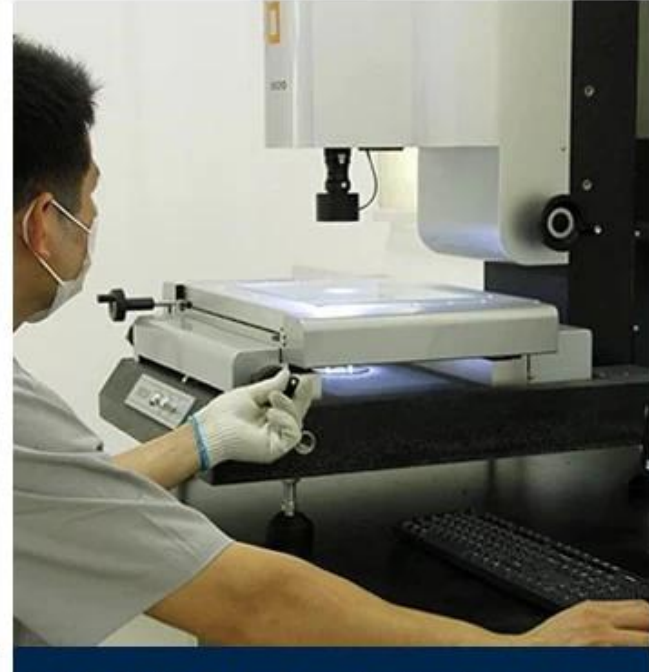
ASA SURFACE THICKNESS TEST