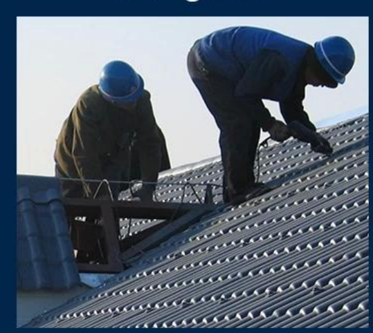
Easy and Quick Installation