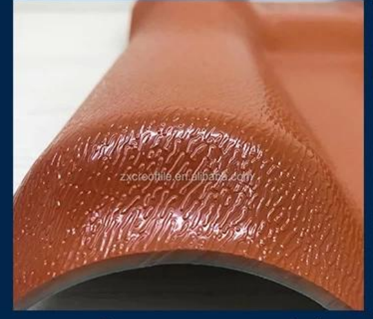
Surface asa material Lasting Color