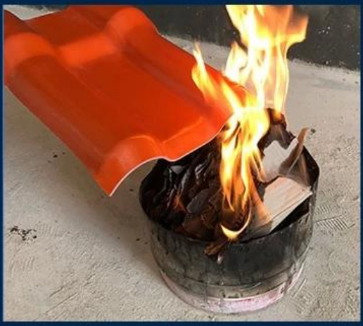
Fire Proof Grade B1